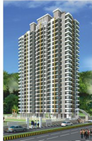
SANGHVI S3 ECOCITY, DAHISAR