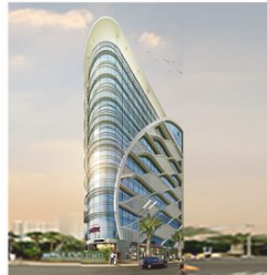
SANGHVI JEWEL, MALAD