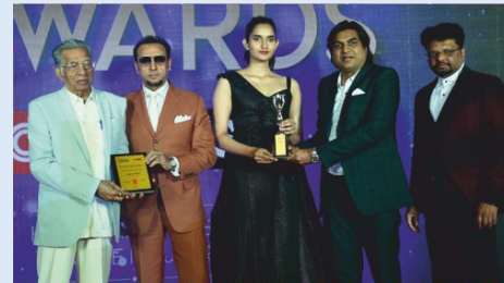
REAL ESTATE & BUSINESS EXCELLENCE AWARD 2020 CNN NEWS