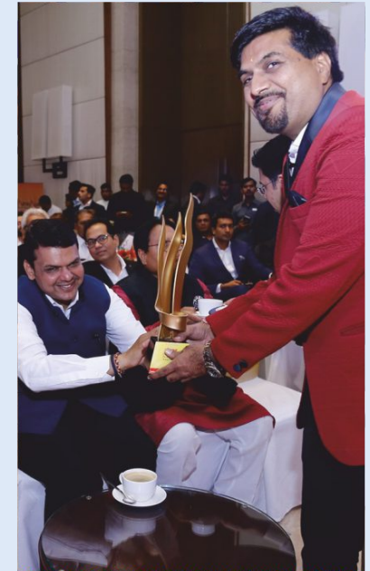
LOKMAT CORPORATE EXCELLENCE AWARD 2017