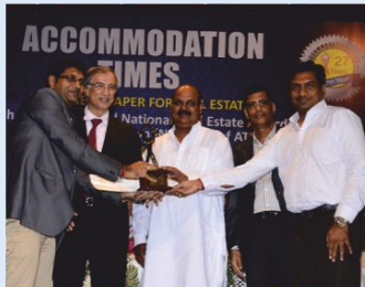
BEST REDEVELOPMENT PROJECT - 2012