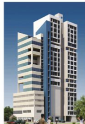
S3 PARSHVA, BYCULLA