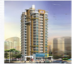
SANGHVI EXOTICA, DAHISAR