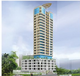
SANGHVI GALAXY, GIRGAON