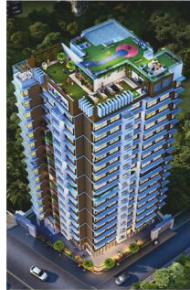
S3 PROXIMA CHEMBUR