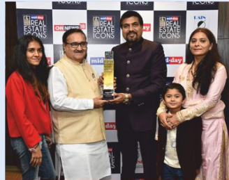
MID-DAY ICONS AWARD 2016