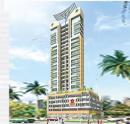
SHREE MOHANKHEDA HEIGHTS, MAZGAON