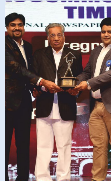
BEST TOWNSHIP 2015 - ACCOMMODATION TIMES