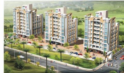
SANGHVI NAKSHATRA, NASHIK