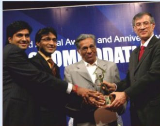
ACCOMMODATION TIMES BEST PROJECT OF THANE 2007

Witness the progress of Sanghvi S3 Ecocity where you can experience a supreme lifestyle with premium residences and several conveniences that puts you at ease. It is our milestone project that befits every wish.