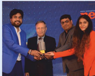
BEST TOWNSHIP 2016 - REALTY PLUS AWARD