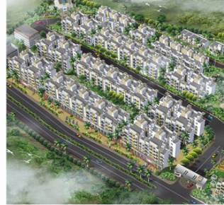
SANGHVI S3 PARADISE, ASANGAON (SHAHPUR)

At Sanghvi S3 Group, we understand the pure joy of owning a home. The most precious gift one can give to their loved one. An ideal space that makes every moment cherishable. In Sanghvi S3, S3 stands for Shaping Smart Spaces, which fits the desire of our customers. We aim to have a smooth process for our customers from the inception of our project to its timely delivery.