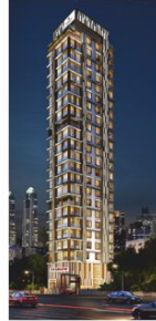
S3 LEGEND, TARDEO