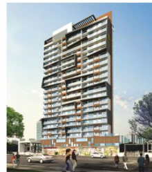
S3 ORION, BYCULLA