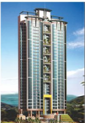
S3 GENEX, LOWER PAREL