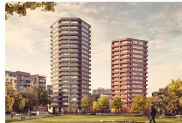
SANGHVI S3 SKYCITI, DOMBIVALI