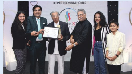
TIMES REALTY ICONS AWARDS - 2019